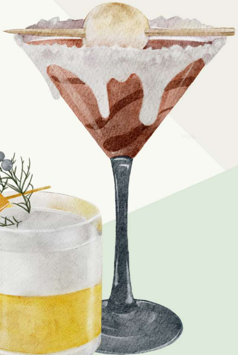
Vanilla - ksh 400