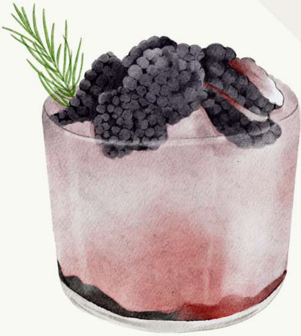
Strawberry- ksh 400